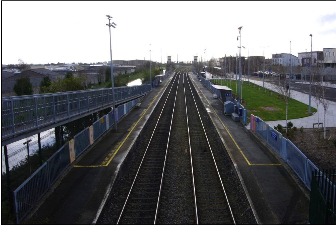
Plate 20.1 View of MGWR (CHC001) from west