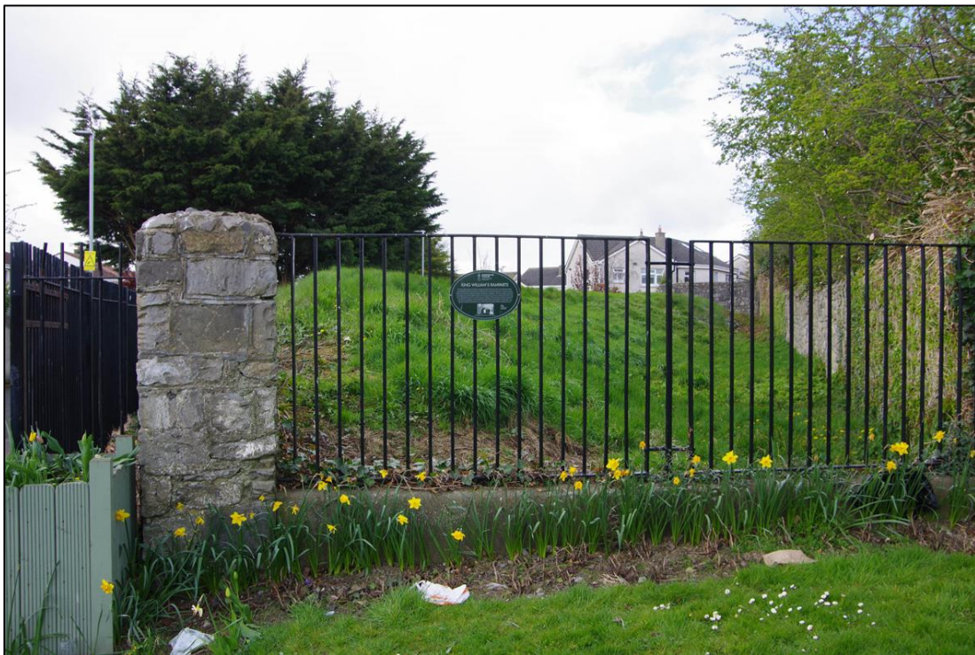
Plate 20.10: View from east towards south section of King William's Rampart (CHC027)