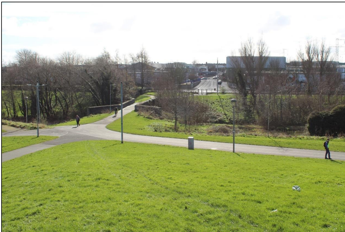
Plate 20.6: View from north towards Finglaswood Bridge (CHC009)