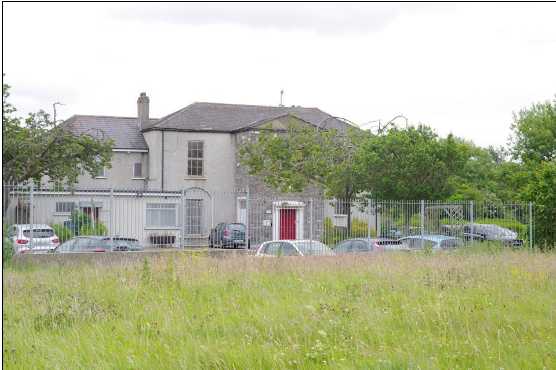
Plate 20.9: View from west of St Helena's House (CHC020)