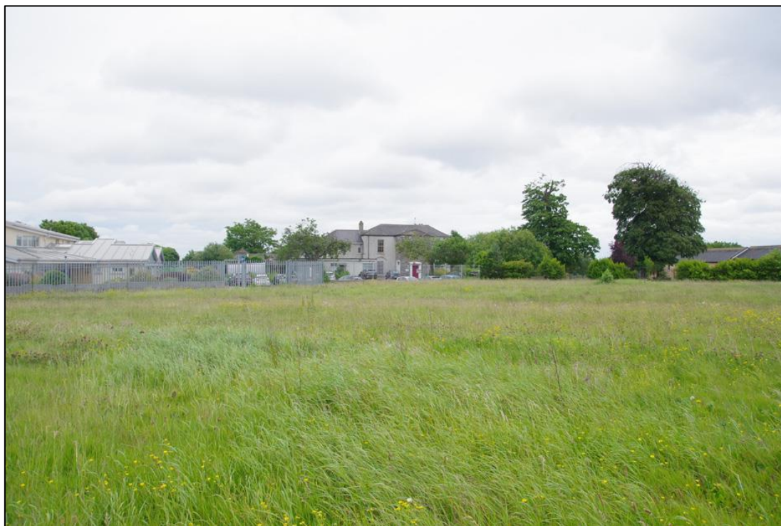
Plate 20.8: View from west towards St Helena's House (CHC020)