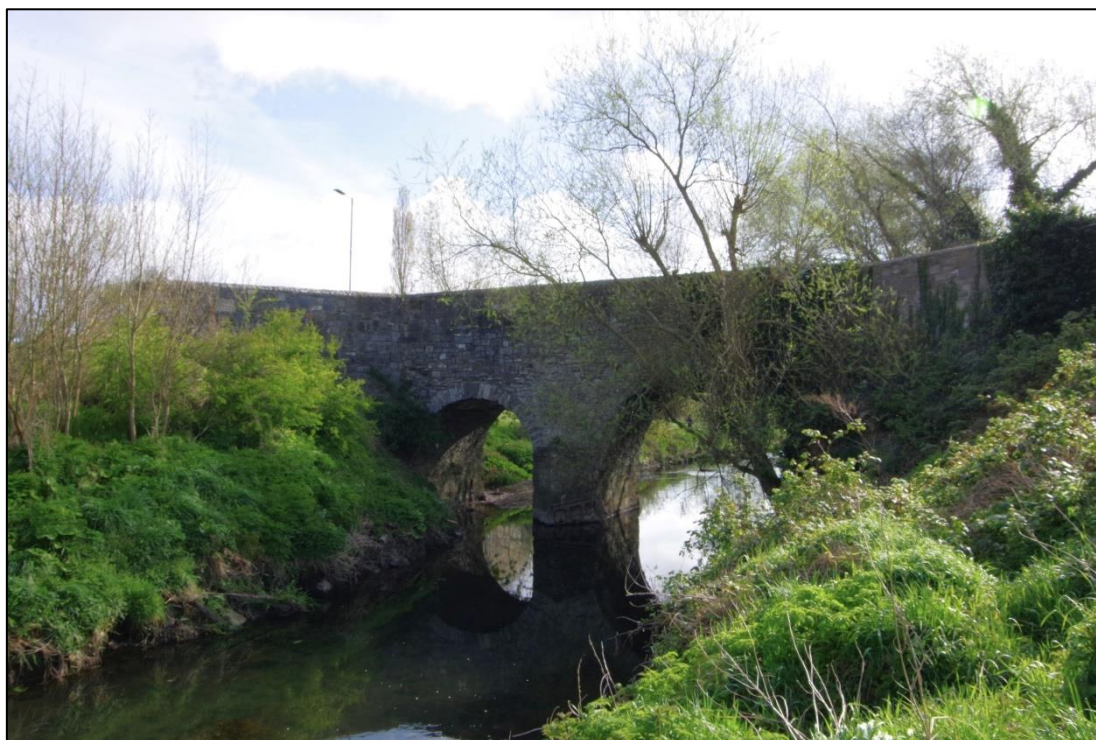
Plate 20.7: View from west towards Finglaswood Bridge (CHC009)