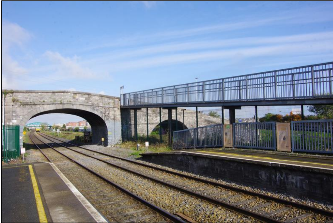
Plate 20.3: View from east of south end of Broome Bridge (CHC001.1) over railway