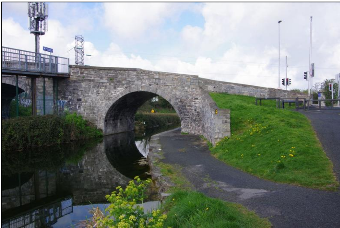
Plate 20.4: View from east of north end of Broome Bridge (CHC001.1) over canal