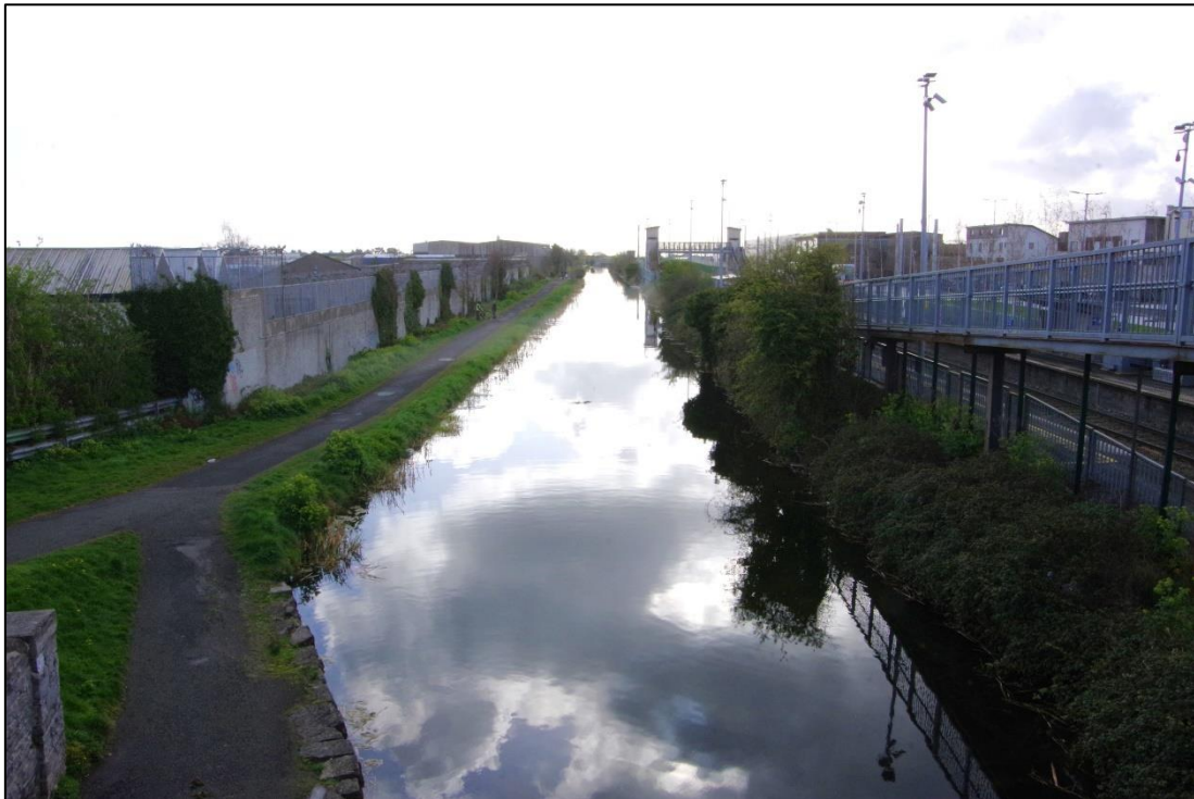
Plate 20.5: View from west of Royal Canal (CHC003) and towpath (CHC003.1)