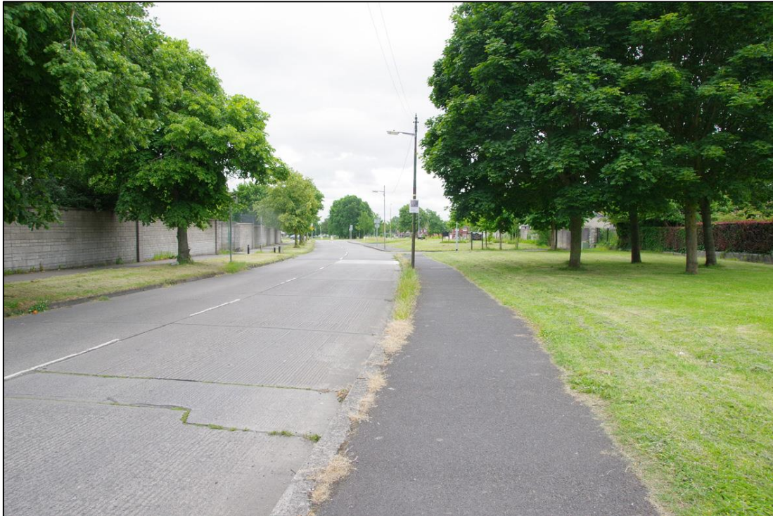
Plate 20.11: View from north of Patrickswell Place of projected line of King William's Rampart (CHC027) with LRV pole reused as light pole (CHC028) in centre of frame