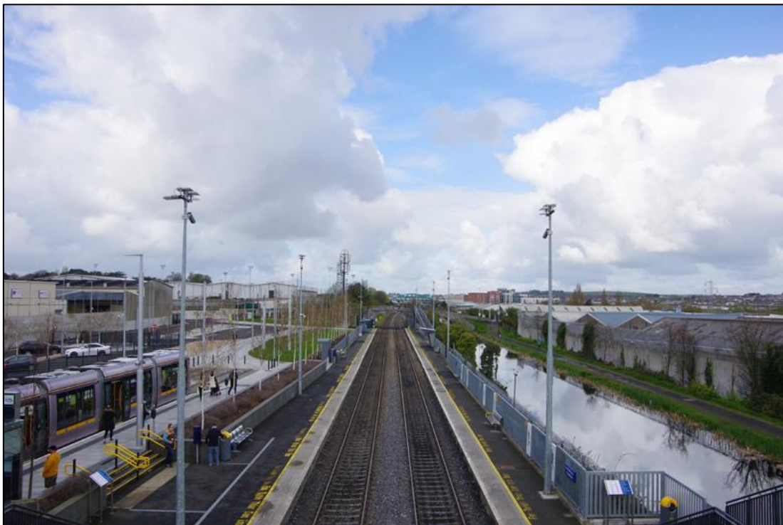
Plate 20.2: View of MGWR (CHC001) from east with Royal Canal (CHC003) visible in right of frame