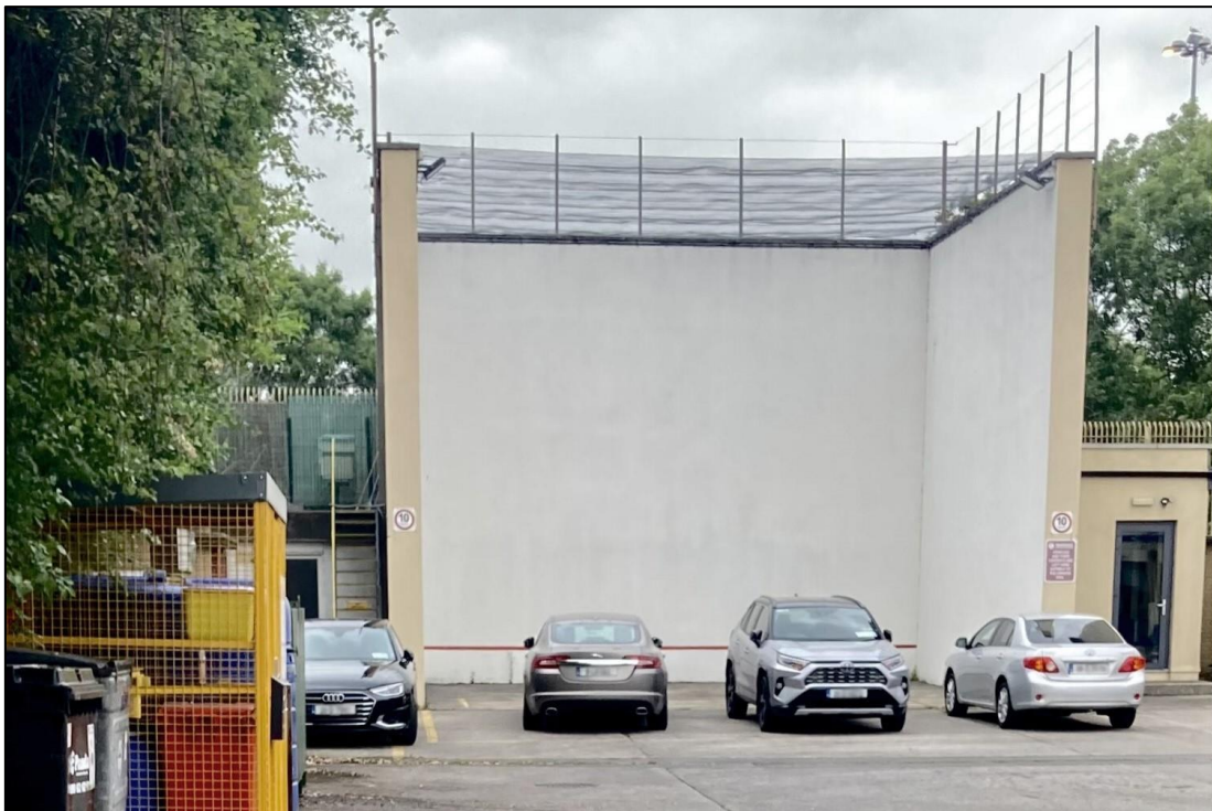
Plate 20.12: View from south of handball alley (CHC036)